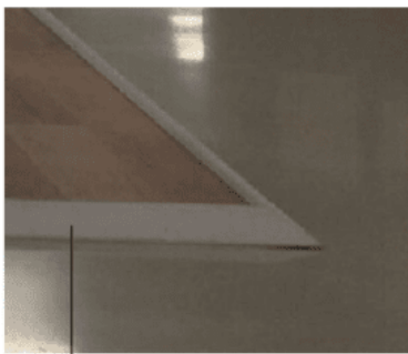
↑ Raised floor (4cm) with sloping edges, finished with wooden laminate.